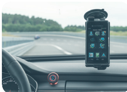
PGMS efficiency for customers and operators