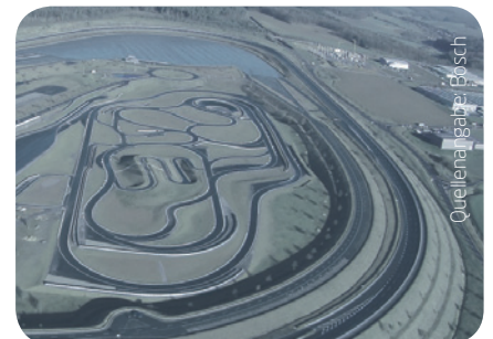
PGMS operations supporting all responsible parties