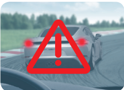
PGMS safety involving all parties affected